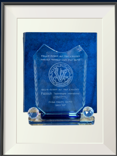
NVI - Ethiopia