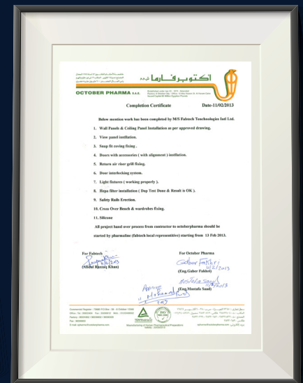
O-Pharma - Appreciation Letter