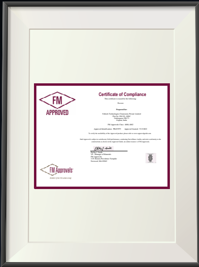
Certificate FM Approvals

Fabtech Technologies Pvt. Ltd. | Annual Report 2022-23