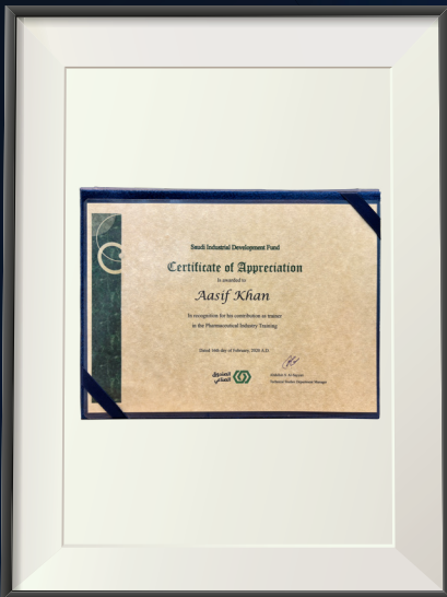
Saudi International Development Fund