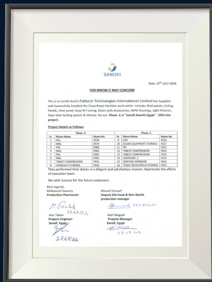
Sanofi - Appreciation Letter