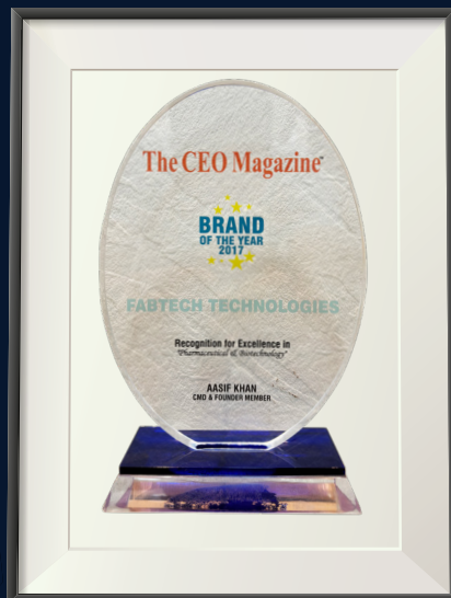
The CEO Magazine - 2017