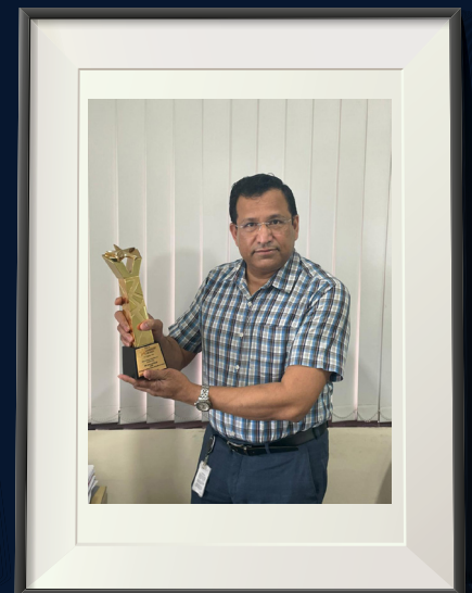
Tech Leadership Awards 2021