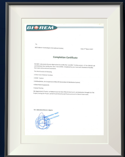
Biorem - Appreciation Letter