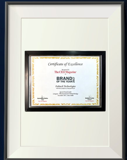
The CEO Magazine - 2017