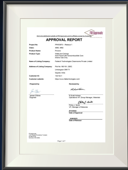
Report FM Approvals