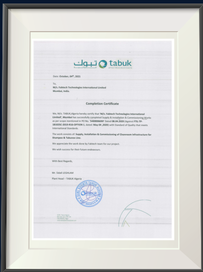
Tabuk - Appreciation Letter