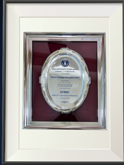
IDMA Corporate Citizen Award 2018