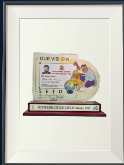
Shivprabha Jeevan Gaurav Award