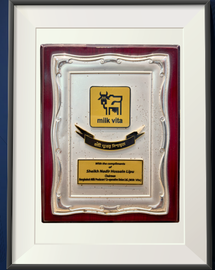
Milk Vita - Bangladesh