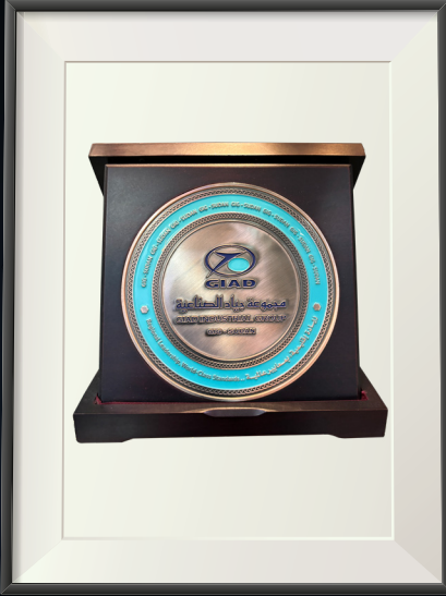
GIAD Industrial Group - Sudan

Fabtech Technologies Pvt. Ltd. | Annual Report 2022-23